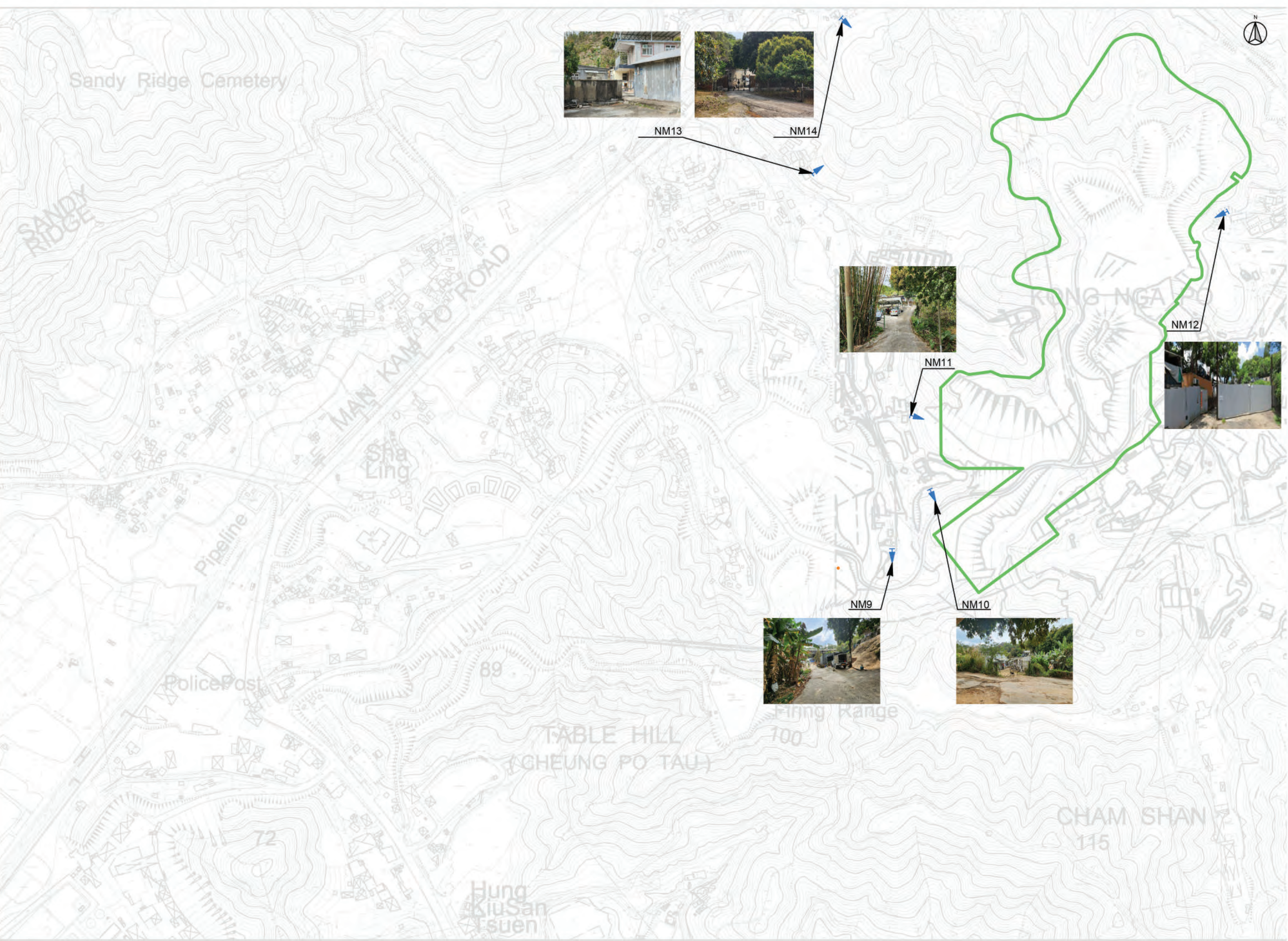
Figure 3 Location of Noise Monitoring Stations