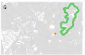
KEY PLAN SCALE: 1/50000