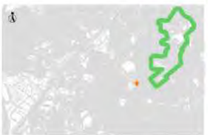
KEY PLAN SCALE: 1/50000