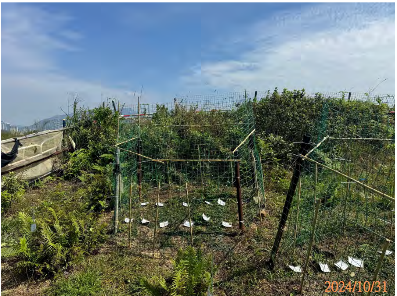
Maintenance works & inspection_6