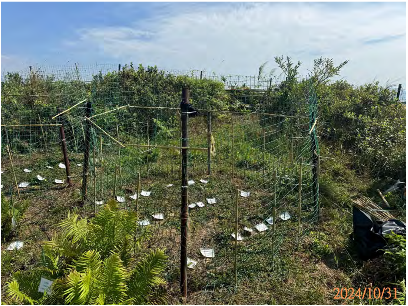
Maintenance works & inspection_5