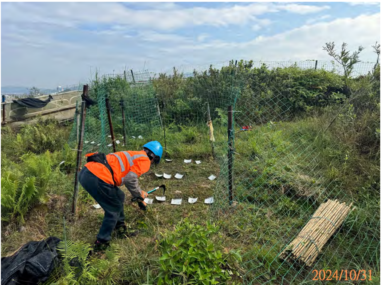
Maintenance works & inspection_2