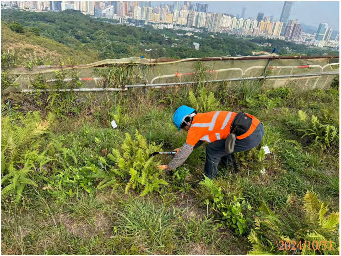
Maintenance works & inspection_3