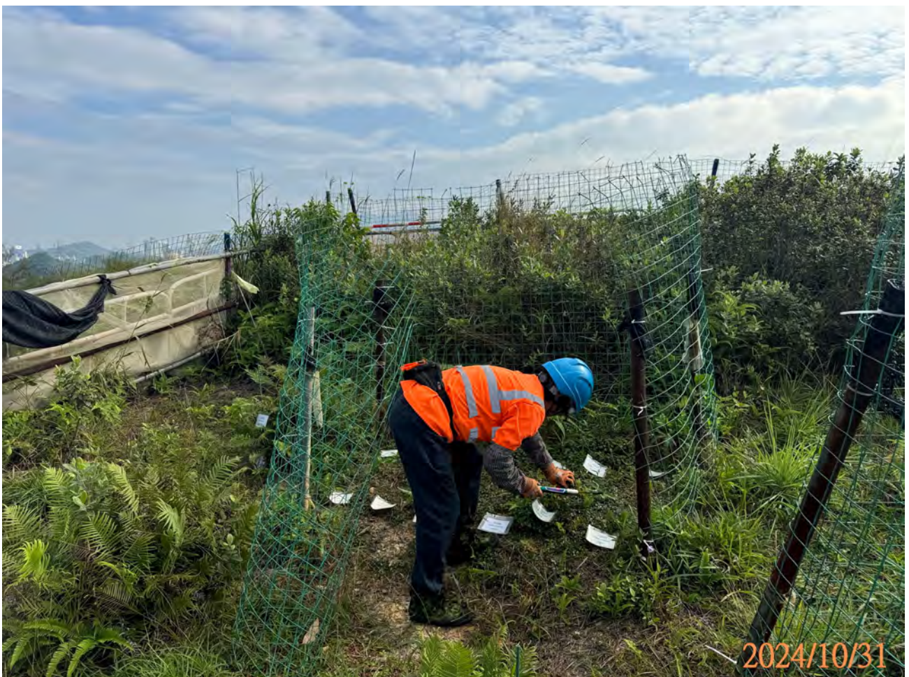
Maintenance works & inspection_4