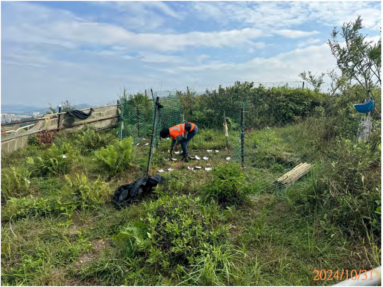
Maintenance works & inspection_1